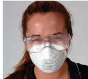
Problem: Foggy glasses