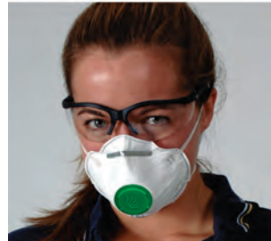
Problem: Clear view & breathing easy!