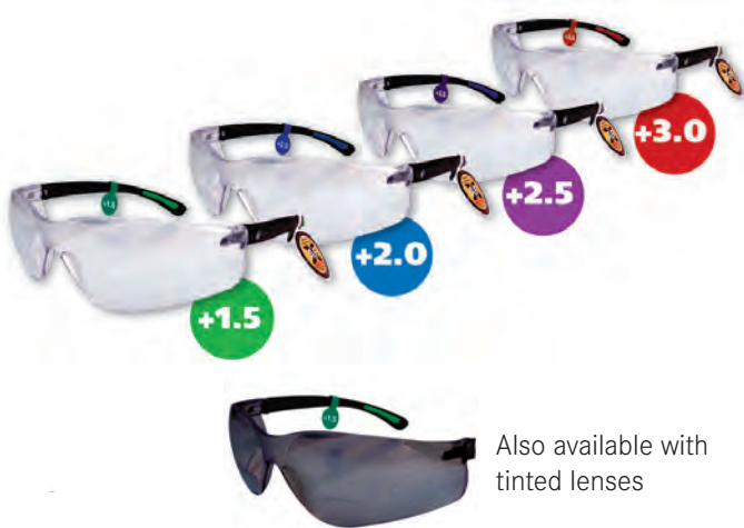
Also available with tinted lenses